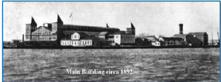
Main Building circa 1892

From 1892 to 1954, over twelve million immigrants entered the United States through the portal of Ellis Island, a small island in New York Harbor. Ellis Island is located in the upper bay just off the New Jersey coast, within the shadow of the Statue of Liberty. Through the years, this gateway to the new world was enlarged from its original 3.3 acres to 27.5 acres mostly by landfill obtained from ship ballast and possibly excess earth from the construction of the New York City subway.